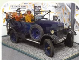
Arthur Ransome / Trojan