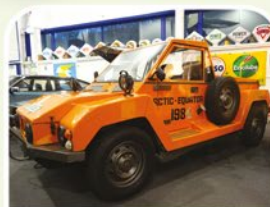
Always something new