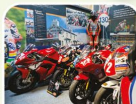
Isle of Man TT