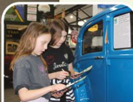
Free children's quiz