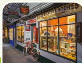
Period shop displays