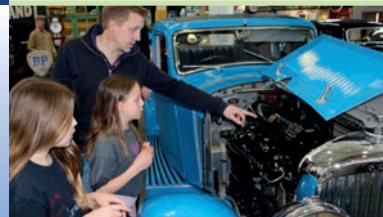
World land and water speed records