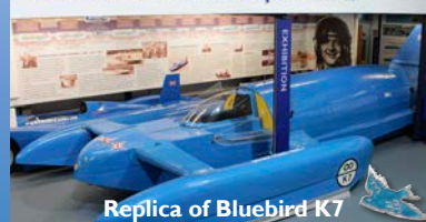
Replica of Bluebird K7