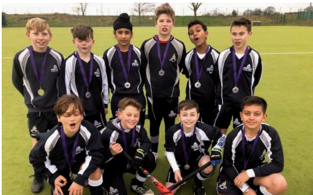
Plate winners at IAPS hosted by Haileybury College. The U12s finished runners-up at their tournament only losing out on top spot by a single goal despite not losing a game on the day and U13s finished a commendable third place out of eight teams securing qualification. In addition to excellent results on the field, participation numbers in the Junior School continues to grow. High numbers of pupils attending extra-curricular clubs has led to additional sessions and fixtures, enabling every child to have the opportunity to undertake the sport outside the curriculum.

It has been an exceptional second half to the season for boys' hockey despite the shortened term this year. Post half term, the fixture schedule shifts with additional matches for the Junior School pupils, affording them the opportunity to develop their skills in a competitive environment. For the first time in Chigwell history all three Junior School teams U11s, U12s and U13s progressed from the county rounds of England Hockey In2School Tournaments to the regional stages of the competition. The U11s competing in their first Essex and IAPS tournaments, won the county tournament and finished as