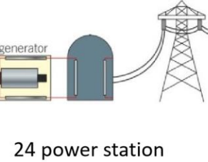
24 power station