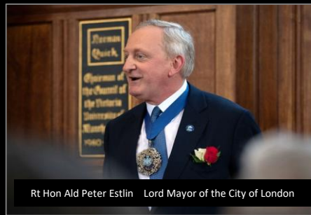
Rt Hon Ald Peter Estlin Lord Mayor of the City of London