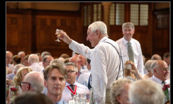
As the outside temperature in Manchester rose to a record 33°C, the Chairman's executive decision to permit gentlemen to remove their jackets (left) was gratefully received