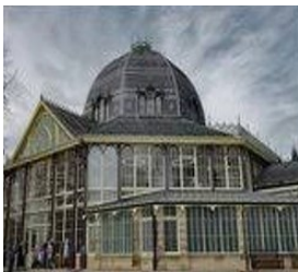
The Octagon Hall