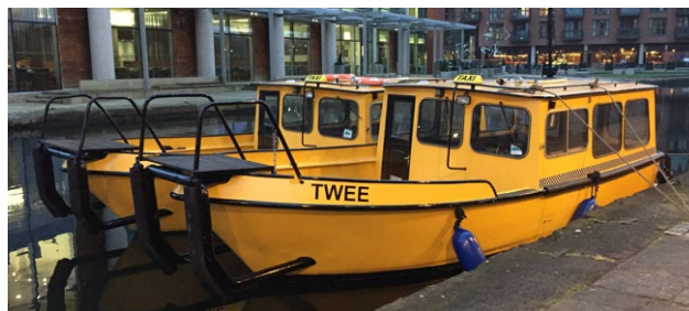
Leeds Dock Water Taxi

The Royal Armouries is a short walk or taxi ride (including the option of the water taxi if desired) from Leeds Station, with excellent train services from across the country.