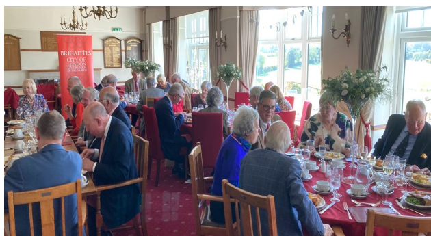
Brigantians dining at Lindrick in 2023

We will start with a Fine Dining Dinner in the Clubhouse on the evening of the Wednesday 15 April. This is open to all Brigantes Members, non-golfers as well as golfers.