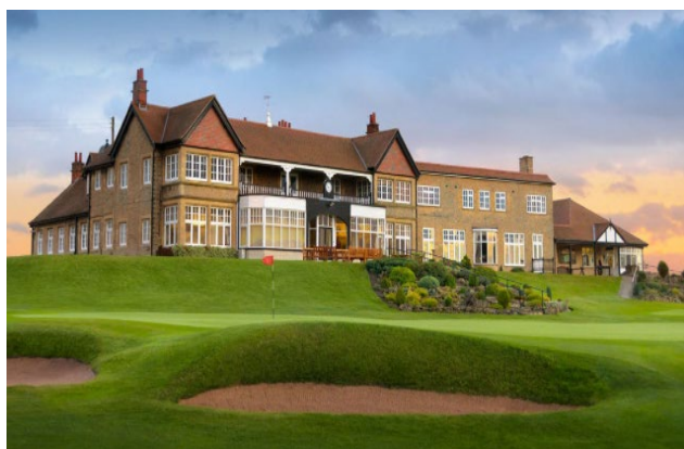
18th Green and Clubhouse, Lindrick Golf Club

The championship course at Lindrick, between Sheffield and Worksop, is our venue once more for the Brigantes Golf Spring Meeting.