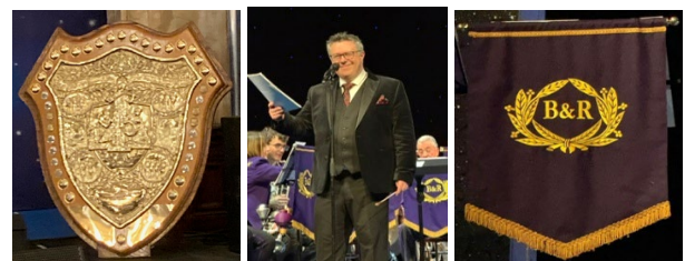
The Band proudly displayed their Shield of Honour as the current UK Brass Band Champions

Here the Brighouse & Rastrick Brass Band treated us to a festive programme of traditional and modern music.