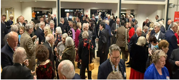
Winter Gathering Reception

A highly convivial reception and early evening supper in the Octagon Hall followed.