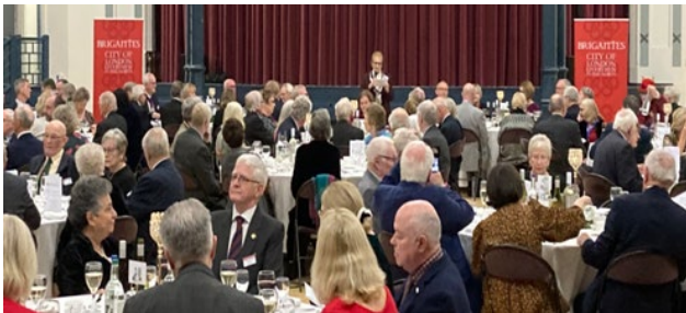
Supper and speeches in the Octagon Hall