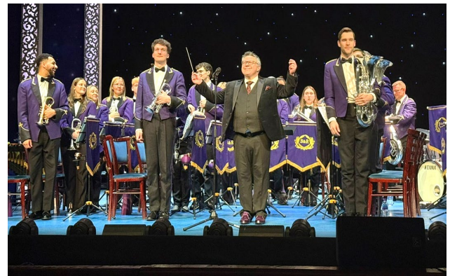
The Brighouse & Rastrick Brass Band at the Brigantes Winter Gathering

At 7.30 we joined the audience in the adjacent Buxton Opera House for this year's Christmas Concert. The Opera House, opened in 1903, has a magnificent, gilded auditorium created by the famous theatre architect Frank Matcham, who designed the London Palladium.