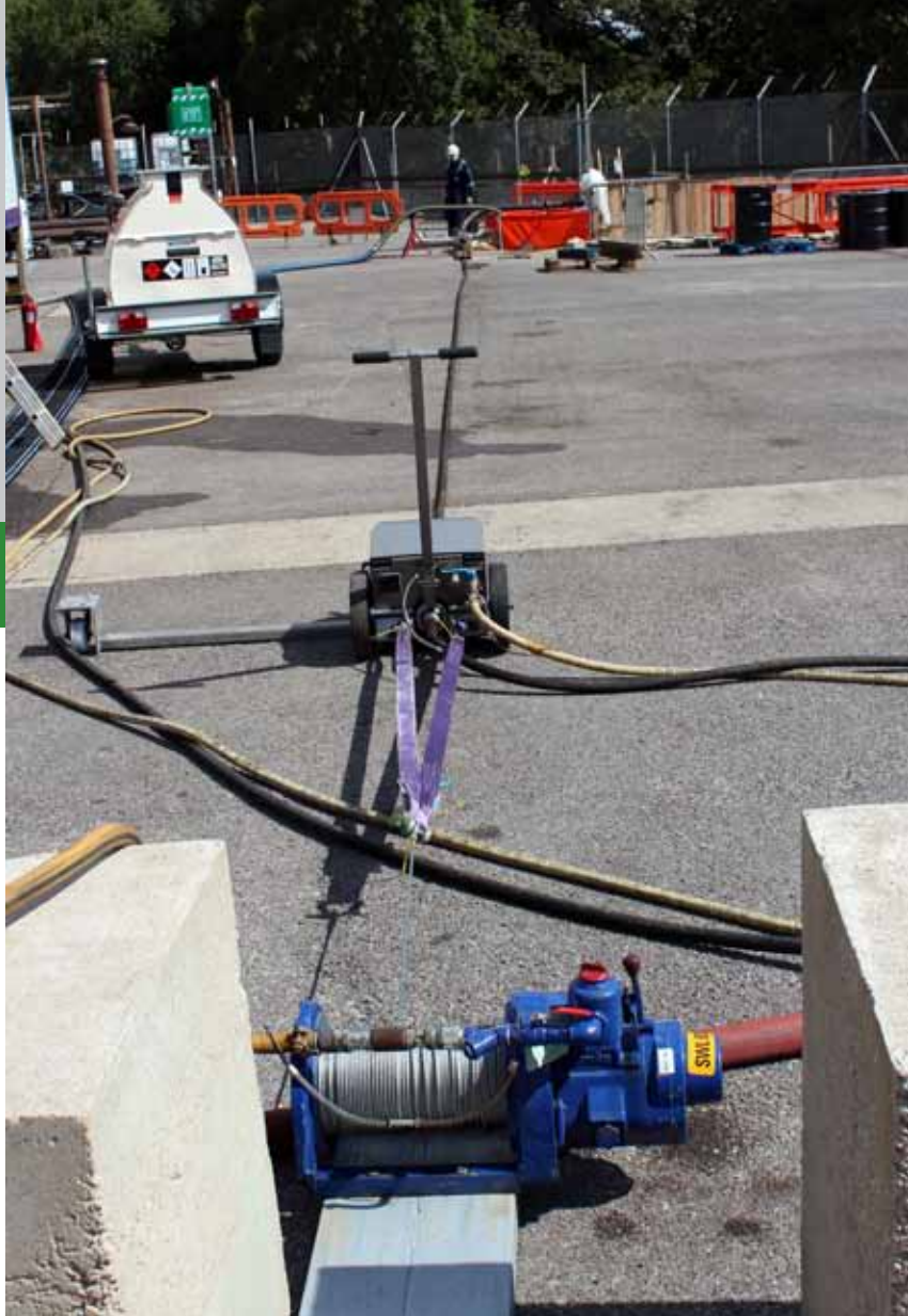
Hose removal in progress

The blockage removal rate will be determined dependent on pipe diameter, blockage type, length of pipe, number of bends and whether pipes are horizontal or vertical.