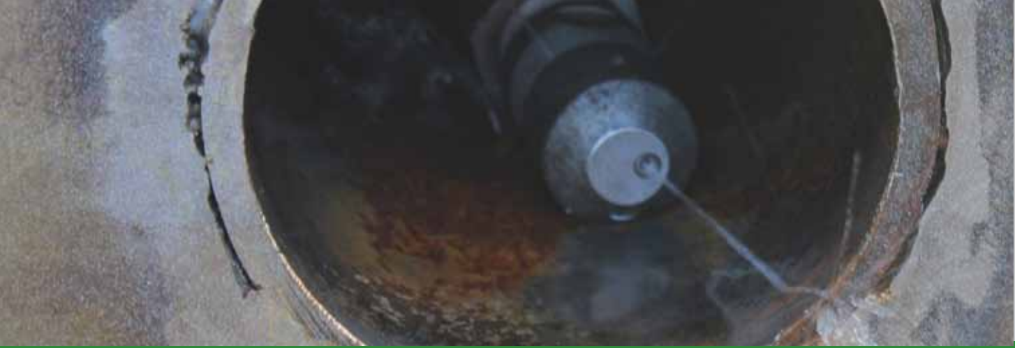
Multi orifice cutting nozzle