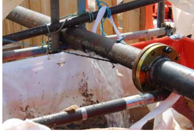
Liquid & product recovery in progress