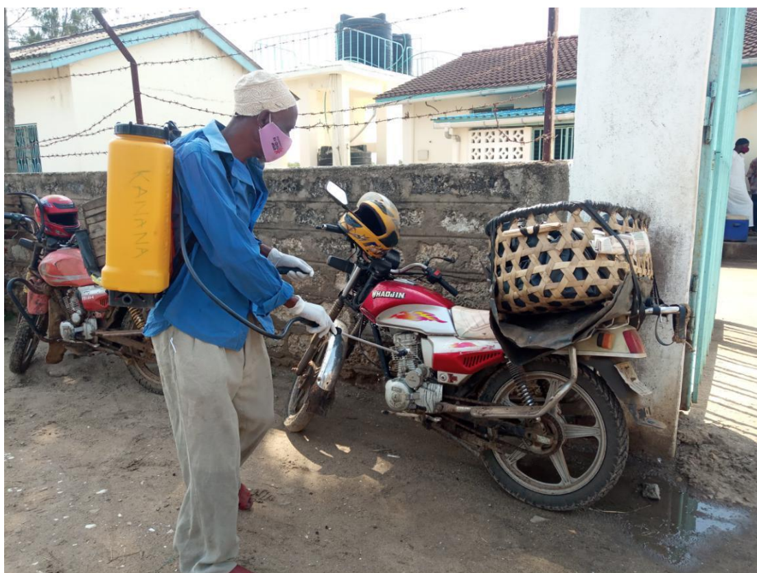
Fig 3: A committee member disinfecting a motorcycle.

17 th 18 th and 19 th September 2020 - Community consultative meetings between Vanga Blue Forest Community Based Organization and community members were convened. The community members were to decide which community projects were -to be developed with start-up funds from the Leonardo DiCaprio Foundation held by Edinburgh Napier University. Each village identified its own priority project. Vanga prioritised construction of an access road, Jimbo prioritised restoration of a water logged nursery school and Kiwegu construction of furniture for the medical dispensary.