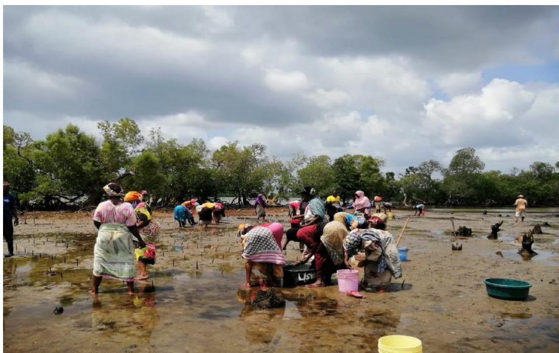
Fig 5: Jimbo community members taking part in mangrove planting

21 st November 2020 - Community Action for Nature and Conservation (CANCO) in collaboration with Jimbo Environmental Group (JEG) invited VBF to mark the World fisheries Day at Jimbo village by participating in planting 2,700 mangrove seedlings. About 65 people participated, with the majority being women.