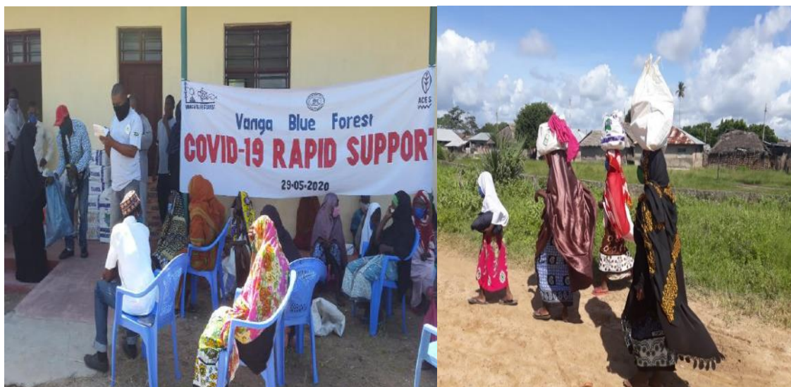
Fig 1: The carbon offset committee members distributing food to residents of Vanga, Jimbo and Kiwegu village.

29 th May 2020 - Vanga Blue Forest - Community Based Organisation mobilized Covid-19 rapid support donations to support in cushioning and reducing the shock that the pandemic had on the community. Vanga being geographically positioned along the Kenyan coastline and adjacent to the Tanzanian border, fishing which is the main source of livelihood accounting for 80% was greatly impacted. The donations included food, facemasks and soap. The criteria of selection were orphans, widows, elderly and those living with disabilities. Through the donations we managed to reach out to 83 households.