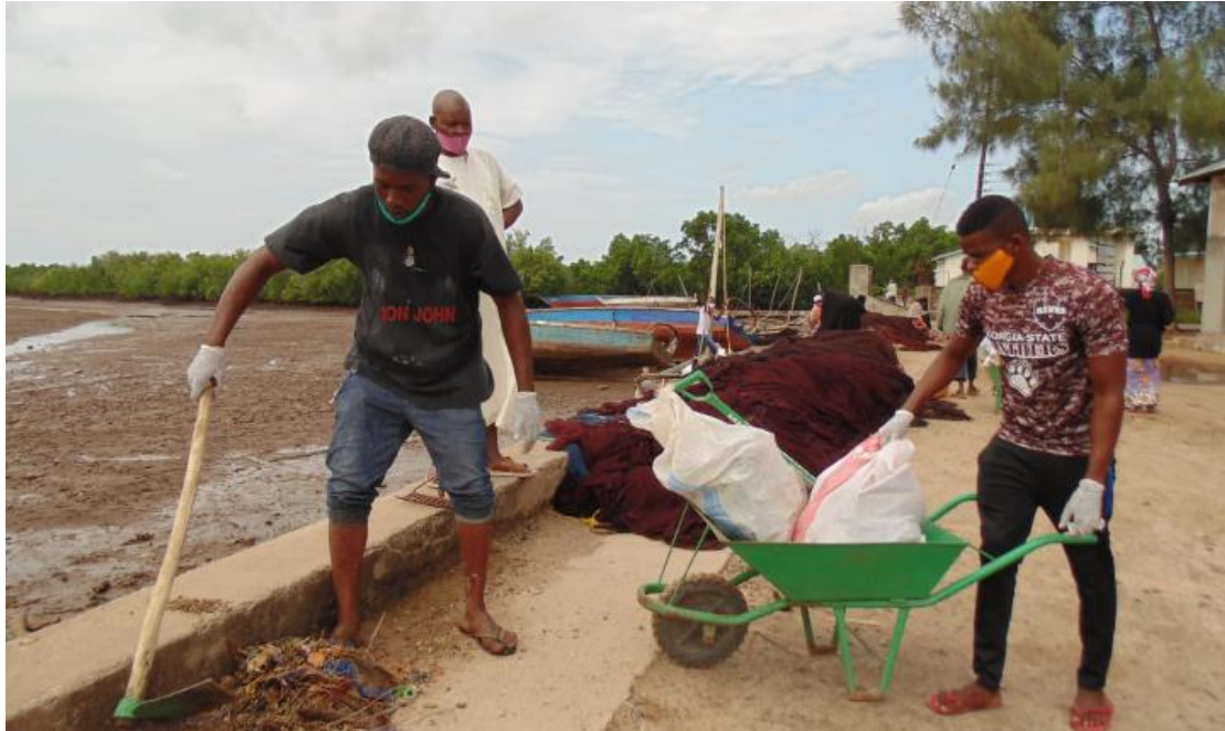
Fig 2: Youth collecting waste nets adjacent to the Vanga sea wall

The event comprised of thirty five members of the community including Vanga, Jimbo and Kiwegu (VAJIKI) Community Forest Association (CFA) committee, Mwambiweje and Mwagugu user groups, representatives from Kenya Fisheries Services, Kenya Marine and Fisheries Research Institute and Chombo media.