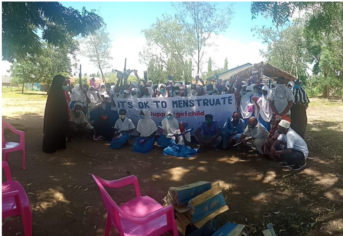
Fig 6: Period poverty project at Kiwegu

27 th November 2020 - VBF team organised a period poverty support project in Kiwegu village with funds sourced via ACES from donations. The aim of the support action was to educate the young girls on menstrual education and eliminate school absenteeism due to lack of menstrual sanitary products. A total of 108 girls obtained a pack of five reusable sanitary towels and a bar of soap. This was intended as a pilot project, responding to a request from the community, and its success means we will aim to continue and expand it next year.