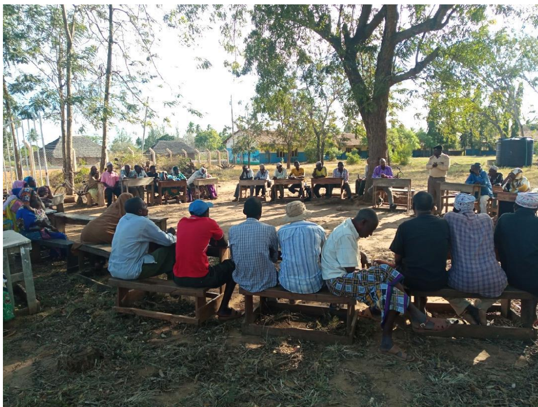
Fig 4: A community consultation meeting (baraza) held at Kiwegu village.

21 st November 2020 - Community Action for Nature and Conservation (CANCO) in collaboration with Jimbo Environmental Group (JEG) invited VBF to mark the World fisheries Day at Jimbo village by participating in planting 2,700 mangrove seedlings. About 65 people participated, with the majority being women.