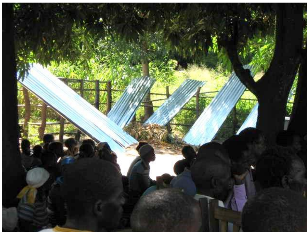
Tin roofs purchased on pay day.

The community bought 740 tin roofs which are much better able to resist the rains during the wet season and give families some stability in their houses. Seven people bought motorbikes, which will revolutionise their ability to access markets. Four people bought cement, 13 bought telephones, 2 bought generators, 17 bought bicycles, 1 bought a radio and 11 bought car batteries. One person even bought a TV.