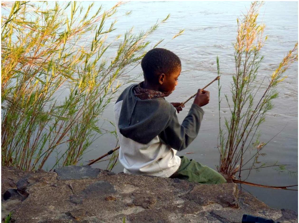
Picture: The next generation.