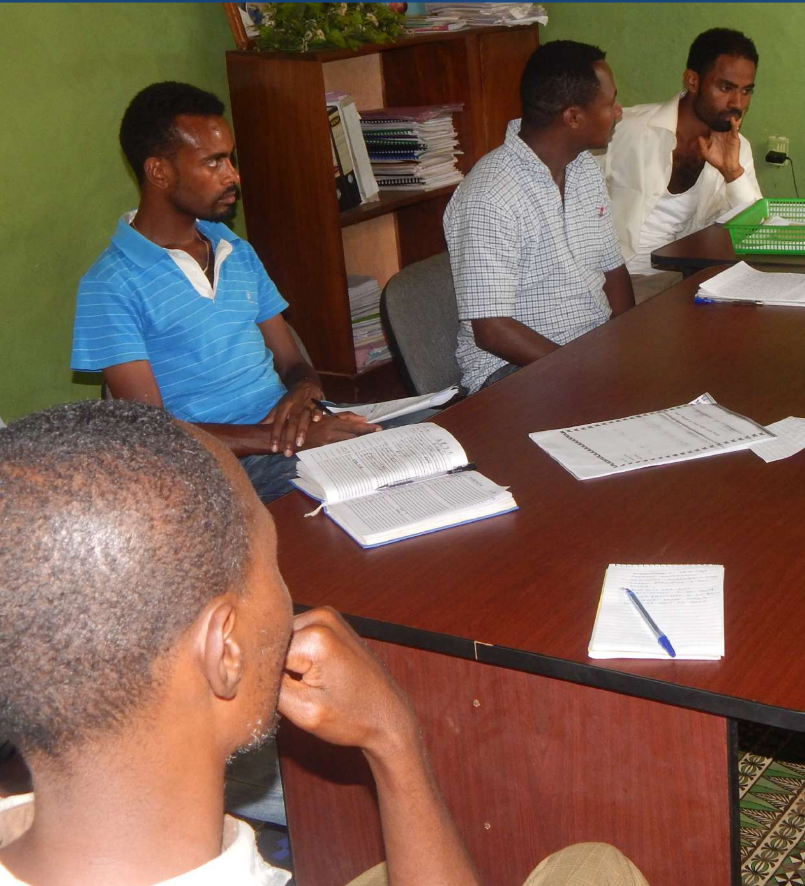
Meeting with members of a local institution, as part of a project in Ethiopia