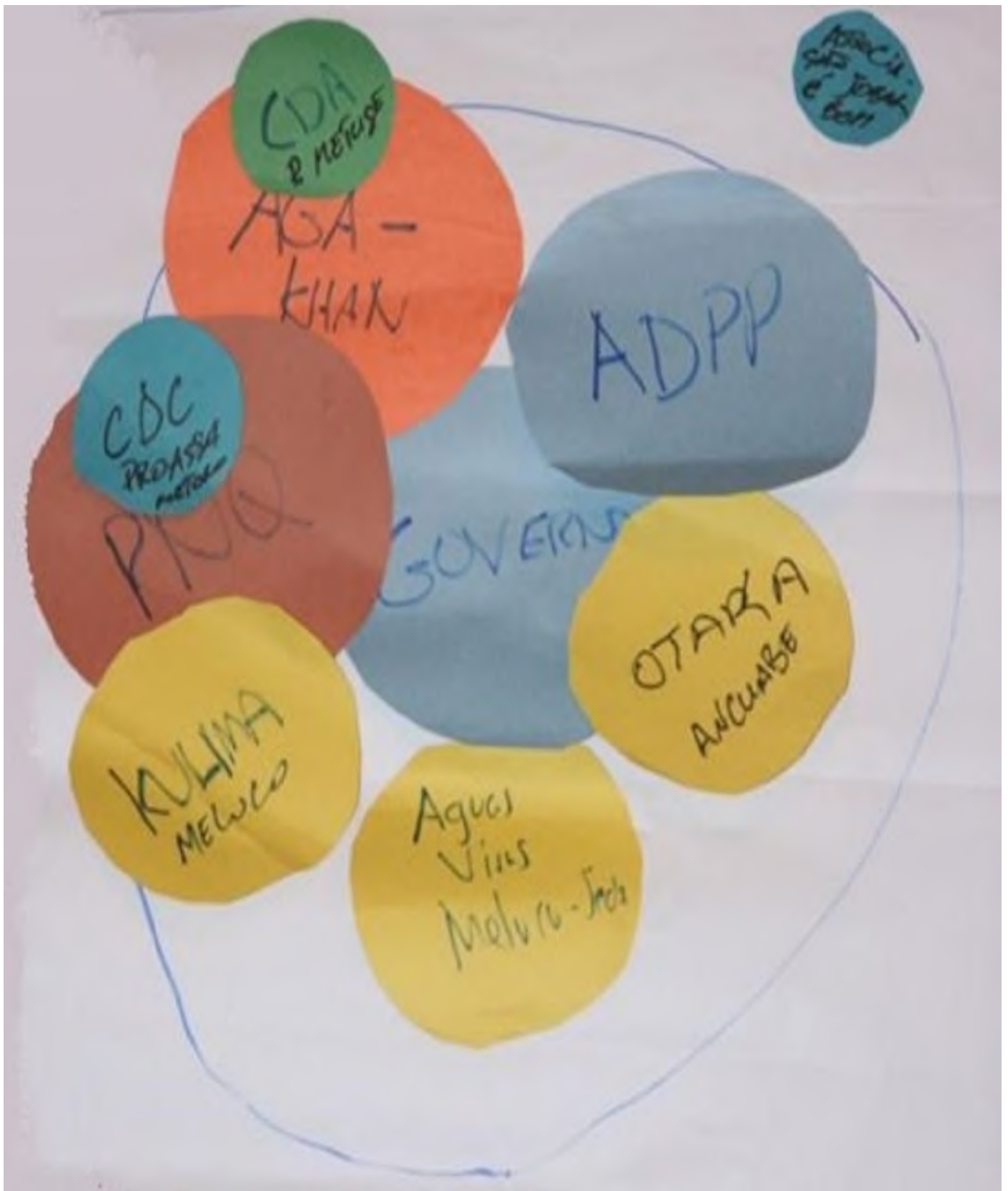
Example of diagram created by community in Mozambique