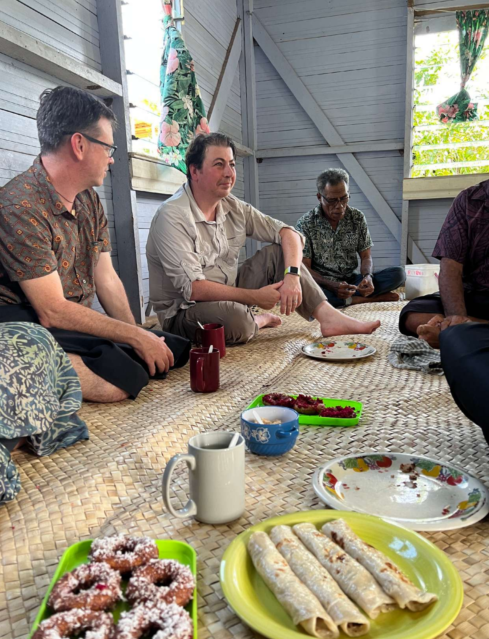
Refreshments provided at a community meeting in Navaralagi village, Fiji, part of the Drawa Rainforest Conservation project.