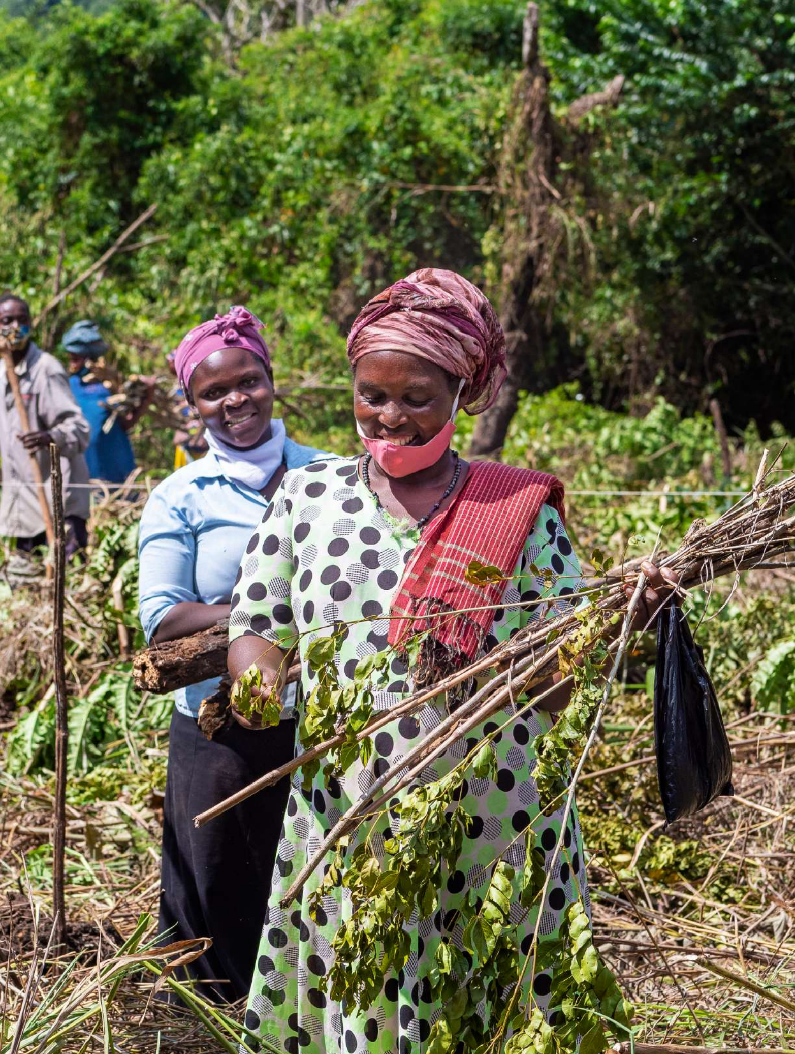
Smallholder farmers in the Trees for Global Benefits project, Uganda.