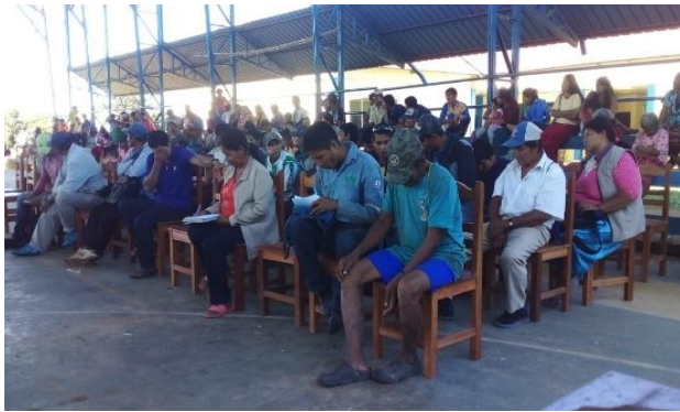
Fig A.5: Training, theory on agroforestry