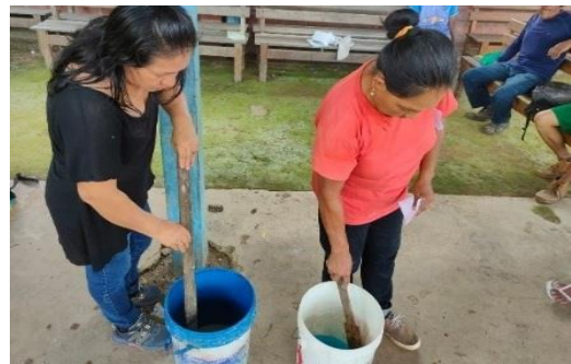
Fig A.8: Training on preparation of organic fertilizers