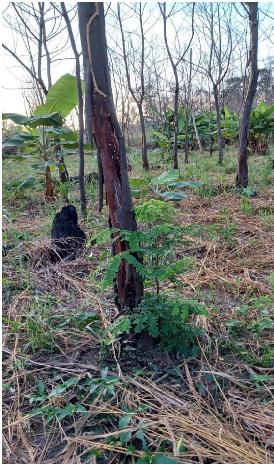
Fig. A.13: Resprouting of Sthryphnodendrum purpureum

The first results show that not all woodlots which suffered from fires are completely lost. Teak for example was recovering fast after fires, but in the stem a lot of sprouts appeared which needs to be pruned. Most Centrolobium tomentosum and Sthryphnodendrum purpureum trees seemed completely dead but months after the fire new sprouts starting from the bottom appeared. In figures A.13 and A.14 resprouting is shown 4 months after the woodlot was burned. For these species a proper management of sprouts will be developed and this will be monitored the coming years.