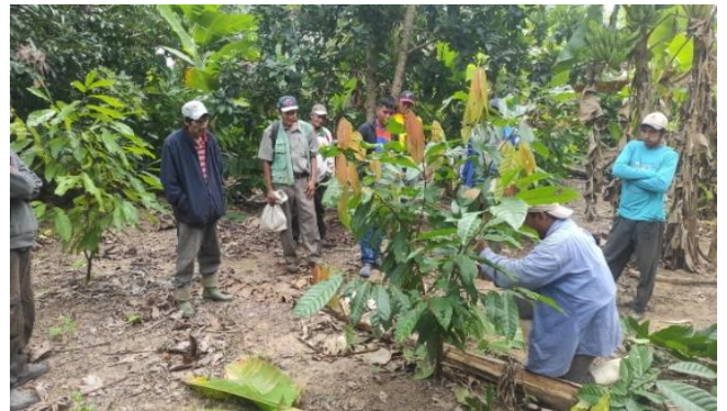
Fig A.6: Training pruning practices