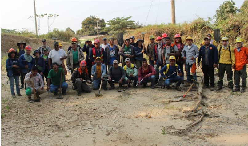
Figure A.4: Sicirec Bolivia team receiving training in fire control

After this general training specific trainings during the year specific trainings took place on tree growth monitoring and impact measurement for the field staff and monitoring team.