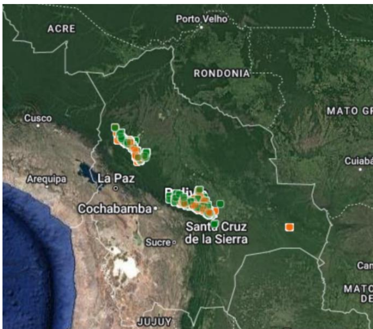
Figure A.1. Location of ArBolivia project areas

The plantations are located in the Pre-Andean or Pre-Amazon region in Bolivia (see map figure A.1), characterized by high precipitation, dominance of fragile alluvial soils.