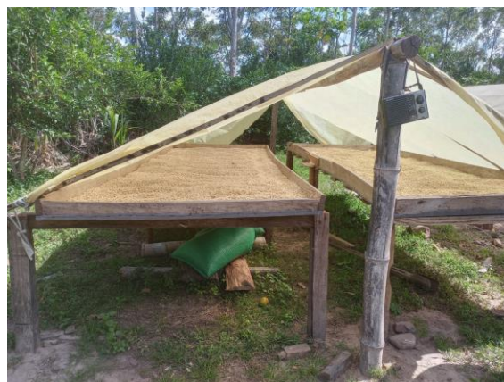
Figure B.2 drying tables

This all resulted in the export of coffee and cacao in 2023 and 2024 and in December 2024 another container with coffee and cacao will be send to Europe and another two containers are programmed for august 2025.