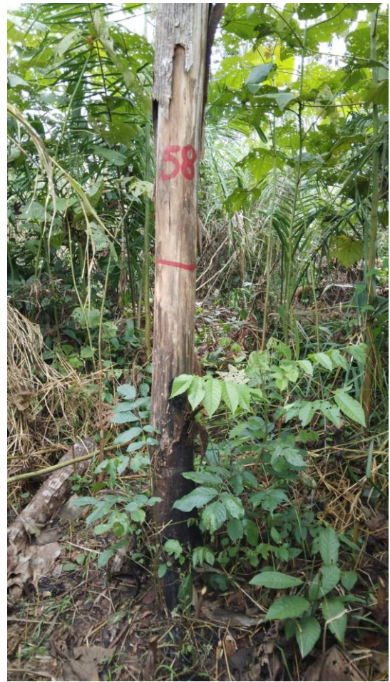
Fig. A.14: Resprouting Centrolobium tomentosum

Follow up has been given to all farmers who suffered from fires, and it was clear that a lot of farmers been discouraged by the fires and it is be hard to motivate these farmers to manage resprouts of trees or do replanting. This required and still requires a lot of effort from the field staff and only in course of 2025 it will be clear if woodlots and agroforestry systems can be restored, replanted or should be considered as lost plantations.