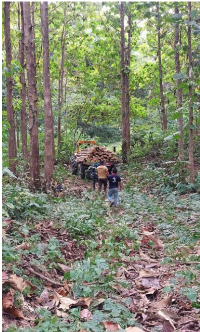
Fig. A.11: Poles from first thinnings

Silvicultural management of the woodlots based on a polycyclic system, where the management is focussed on the development of uneven aged woodlots and agroforestry systems. If thinngs take place, natural regeneration is supported, this will enhance biodiversity and will increase the average GHG-ER.