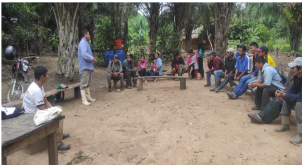
Fig: A.7 Training on organic cropping