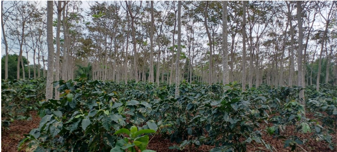
Figure A.11. Coffee with Centrolobium tomentosum