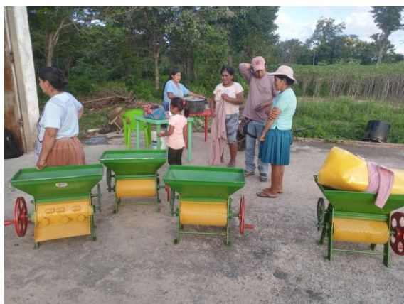
Figure B.1: Delivery of depulping mills

Also, during this year Sicirec Bolivia supported the improvement of the chain with the aim of reducing the loss of production and at the other hand obtain higher quality and therefore higher prices for their products. This was done through training sessions with farmer groups as well on-site training of the individual farmers. At the other hand equipment has been provided to the farmer as. Depulping mills, drying tables (see figure B.1 and B.2) and other equipment to improve the chain development of agroforestry products and be able to access the markets with high quality products.