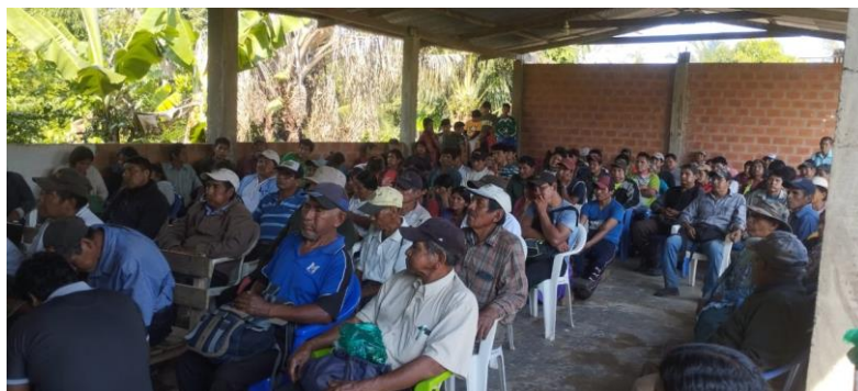
Figure A.9: Assembly Forest Committee "Ambiente Sano"

After COVID and the huge forest fires last year regular meetings with all the members of the forestry committees were suspended, but by the end of 2023 meetings with all the members of the committees were started again as well. 8 assemblies have been taken place and 17 assemblies are programmed for the second half of 2024.