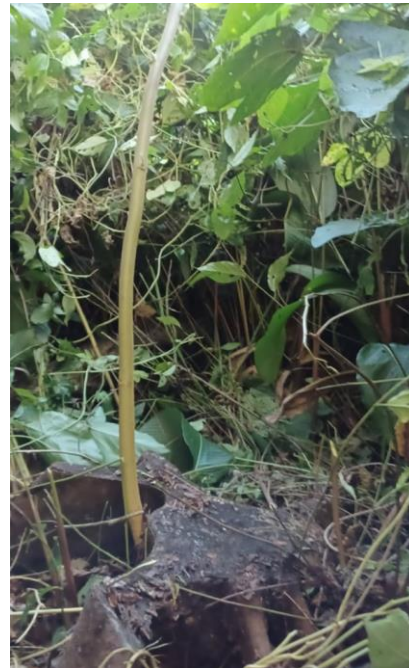
Fig A.12 Natural regeneration of Sthryphnodendrum purpureum , after thinning

However, further development of domestic markets for wood from woodlots and agroforestry systems is needed. The sales of wood from first thinnings continued and the processing of wood from second thinnings showed interesting results by joining efforts with local carpentries and resellers in Santa Cruz and Cochabamba. , 10,046.97 board feet of sawn timber was processed for carpenters and has been partly was used for furniture, utilities, samples, and others. With the University in Santa Cruz an agreement has been signed for the physical and mechanical analysis of the wood, as well the workability of the wood, since the market knows the species but not the wood from these species grown in woodlots.