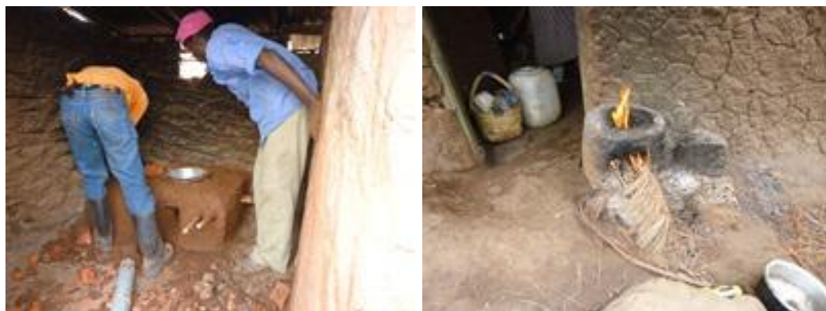
Figure 5. Construction and use of wood saving stove

Facilitation on sustainable energy, especially on construction and use of improved cooking stoves, was carried out with most group members as a way of reducing firewood consumption, CO 2 emissions and other polluting gases.