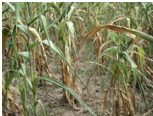
Figure 7. Maize affected by drought