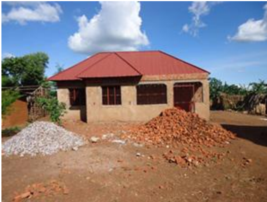
Figure 2: A Plan Vivo producer used part of their carbon revenue to construct a permanent house

Plan Vivo group members were advised by Vi Agroforestry staff on how to use the revenues earned through Payment of Ecosystem Services (PES) for the management of their tree farms and for the establishment and management of future farm enterprises. Some producers who have received the second, or third PES payments in the case of the pilot group, have been able to do some developmental work in their areas: house construction, buying motorcycles, extending farms and starting up small enterprises. Some of the favoured enterprises were Apiculture (bee keeping), local poultry and goat keeping, fish farming and horticultural production.