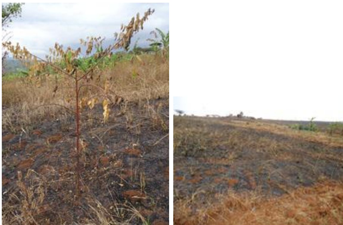
Figure 6. Trees affected by fire

Farmers were advised to change tree to species which are not attractive to termites. Also this advice was given regarding trees that do not tolerate drought. Species like Grevillea robusta and Cedrela odorata have been shown to tolerate drought quite well.