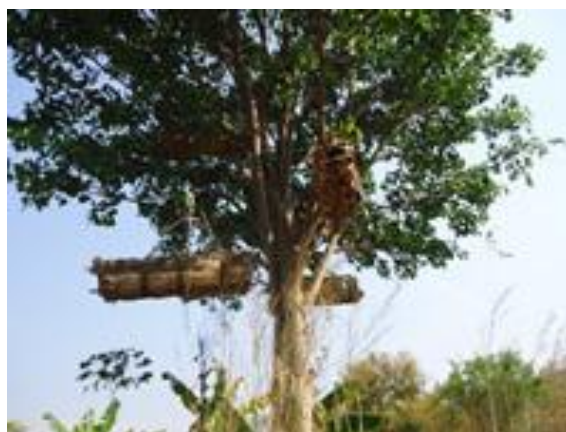
Figure 3. Modern and traditional beehives.

Eleven groups were trained on the merits of fish farming, based on pond construction and management for the purpose of producing fish for improving nutrition and income diversification. Twenty five groups were facilitated on horticultural production and some farmers have started producing fruits and vegetables. In addition to these activities, practical training on plant propagation (budding, grafting and layering) was done in order to provide higher yielding fruit trees, displaying early maturity and better quality fruit. Producers have also been encouraged to plant trees which are more tolerant to common pests and diseases.