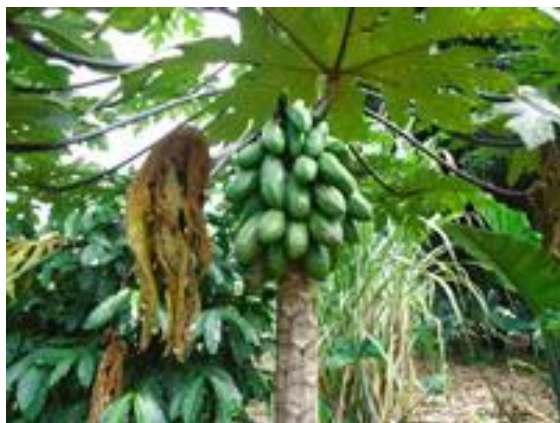
Figures 4a, 4b, 4c. Various farm enterprises: Growing Pawpaw fruit (left); pineapple farming (bottom left); establishing fish ponds (bottom right)

Eleven groups were trained on the merits of fish farming, based on pond construction and management for the purpose of producing fish for improving nutrition and income diversification. Twenty five groups were facilitated on horticultural production and some farmers have started producing fruits and vegetables. In addition to these activities, practical training on plant propagation (budding, grafting and layering) was done in order to provide higher yielding fruit trees, displaying early maturity and better quality fruit. Producers have also been encouraged to plant trees which are more tolerant to common pests and diseases.