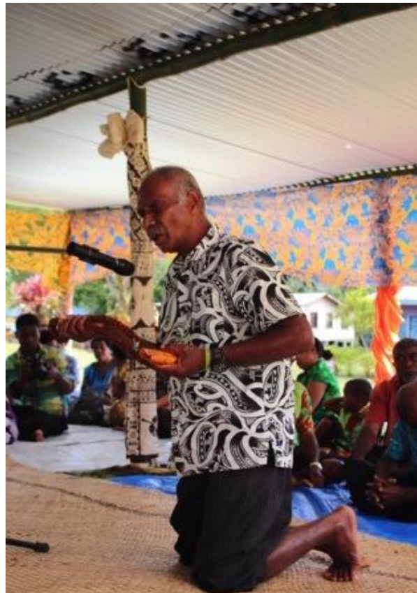
Above: Chief and DBFCC advisor presents tabua (sperm whale tooth) to the Commissioner of the Northern Division at the Drawa project celebration

The celebration ended with a feast prepared for all 200 guests and meke (dancing). The event was a good opportunity to build the profile and raise awareness of the project with clan members, especially those who are not involved in day-to-day management or governance of the cooperative. The event and also received significant media attention at the national level in Fiji, and on ABC Pacific news in Australia.