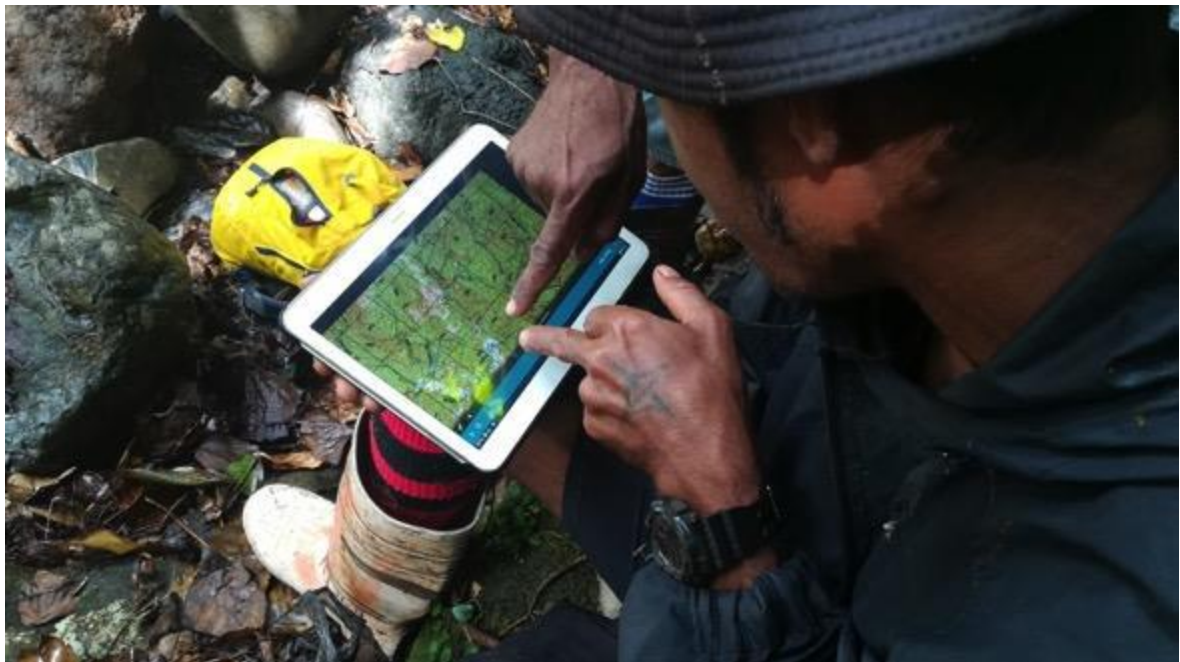
Above: Rangers use Avenza Maps to record location and observations of significant species of flora and fauna.

The Drawa Rangers commenced biodiversity monitoring through two field trips (6 field days), undertaken in June and August 2019, and established a work program for ongoing monitoring. Biodiversity records were collected when Rangers undertook forest inspection surveys, including the transect walks, boundary inspections and 'risk area' inspections. In June 2019 fieldwork, data was collected on paper forms and location recorded using hand held GPS. In August 2019, the rangers used Avenza Maps to record point data location and information on the significant species observed, including taking geo-referenced photographs of species recorded.