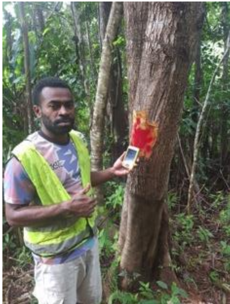
Right: DBFCC Ranger coordinator & board member records the location of a tree painted red to indicate the 'buffer zone' to the eligible forest area.

Rangers erected signs and undertook boundary marking adjacent to the eligible forest areas (EFAs). The purpose of signage and boundary marking is to alert villagers to the location of the boundary of the protected area. Under the project and management plan, clearing land for gardening or harvesting of trees is 'tabu' (prohibited) from the EFAs. Boundary marking is undertaken by cutting a small patch of the outer layer of bark from a tree to reveal the wood beneath, and spray painting the wood with red spray paint. The boundaries are strategically marked where they are in close proximity to villages or garden areas where there is a risk of people unknowingly encroaching into the EFA. Boundary marking initially focused on the Nadugumoimoi EFA, which is south west of Drawa Village. The trees are marked approximately 50m from the actual edge of the EFA patch to provide a buffer.