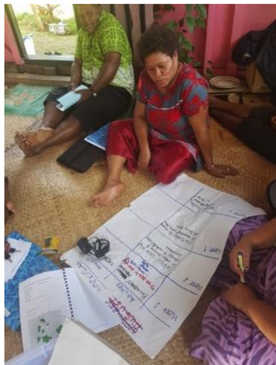
Above: DBFCC board member leading discussions about ranger priorities