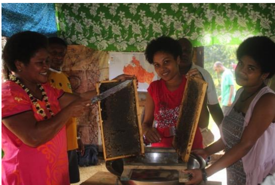
Above: Drawa women involved in beekeeping and collection of honey that is purchased and on-sold by the forest cooperative.

Live & Learn worked in collaboration with the Drawa Block Forest Communities Cooperative (DBFCC) to develop the Beekeeping business and agreed system of operation with the 5 target communities. Implementation approach focused on integrating good governance and business management practices to ensure sustainability and increase levels of participation and ownership. The Drawa Block Forest Communities Cooperative (DBFCC), originally established for the carbon project, plays the central role in managing the beekeeping enterprise.