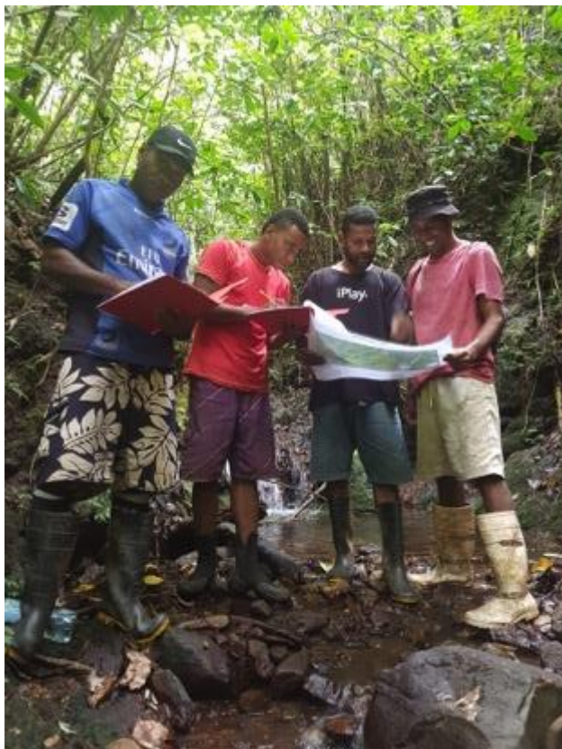
Left: Drawa rangers undertaking forest inspections in the Nadugumoimoi EFA, August 2019

than the handheld GPS. It also provided a simple system for collection of point data observations, such as locations of boundary markers, or biodiversity records. The Department of Forestry assisted Live & Learn to produce geo-referenced PDF maps of the project area suitable for Avenza. This system will be used and further refined for future monitoring work.