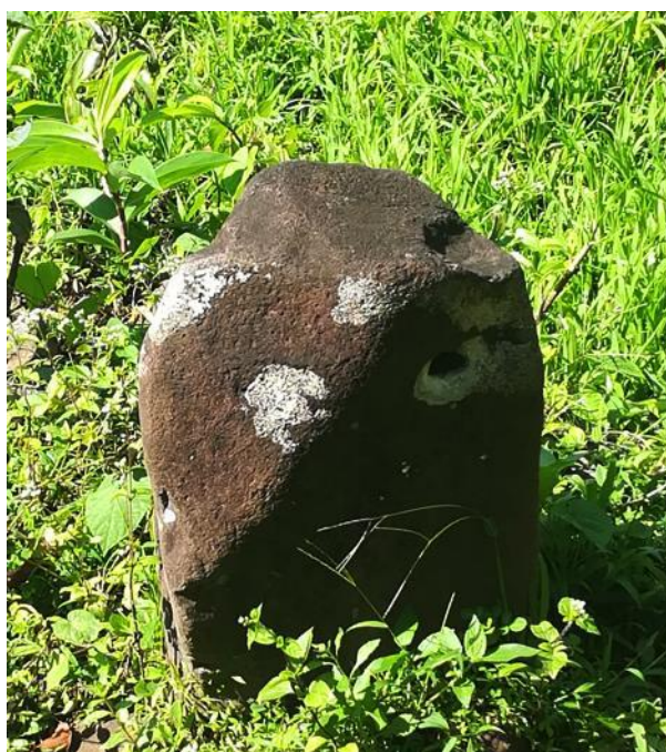
Left: this stone, located near Drawa village, has a hole that can be blown through to create a resonating horn sound. It is traditionally blown to signify preparation of food to bring people together in the village for celebration

The ten-day survey yielded an enormous amount of information and survey of cultural features that littered the project area. The sites documents consisted of hill fortifications, old villages, cemetery, mythical/sacred objects, monuments and historical sites.