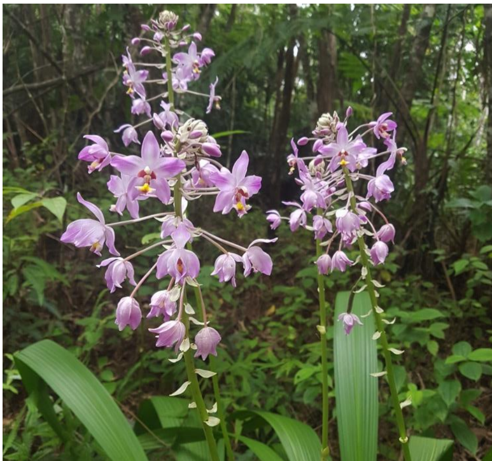
Above: Orchids were the most diverse family recorded in the Drawa forest. 26 species of orchid were recorded in 2018 biodiversity survey. Pictured is an indigenous epiphytic orchid "varavara", Grammatophyllum sp.

Three of the nine principle vegetation types recorded for Fiji, were encountered in the study area: lowland rainforest, upland rainforest and cloud (or quazi montane) forest. The lowland rainforest and the associated riparian vegetation were the most heavily impacted, indicated by the neglected gardens or fallow land, aboriginal introduced tree crops and logged tree stumps. The upland rainforest and cloud forest were the least disturbed except for the tracks into the cloud forest. Also, the upland and cloud forests had higher tree species diversity and density compared to the lowland forest.