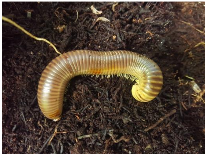
Left: Several species of giant millipede are abundant in the Drawa forest

The target taxa Coleoptera (beetles) recorded 25 families in total and there was a high diversity within the family Formicidae (ants). These taxa provide critical ecosystem services in forests systems such as soil processing, decomposition, herbivory, pollination and seed dispersal. Insects of conservation value recorded from Drawa included: Hypolimnas inopinata (a rare and endemic butterfly), Cotylosoma dipneusticum (rare and endemic stick insects) and possibly three new species within the Odonata endemic genus Nesobasis . These findings suggest that the Drawa forest areas that were assessed, particularly the upland forests and the ridge top forested areas, harbor a good diversity of insects and some endemic and rare insects of Vanua Levu. The conservation value therefore for the Drawa assessed forest areas can be considered as good (i.e. through the presence of rare and endemic species and ecosystem service provision) and forested systems within its upland and ridge top forests intact.