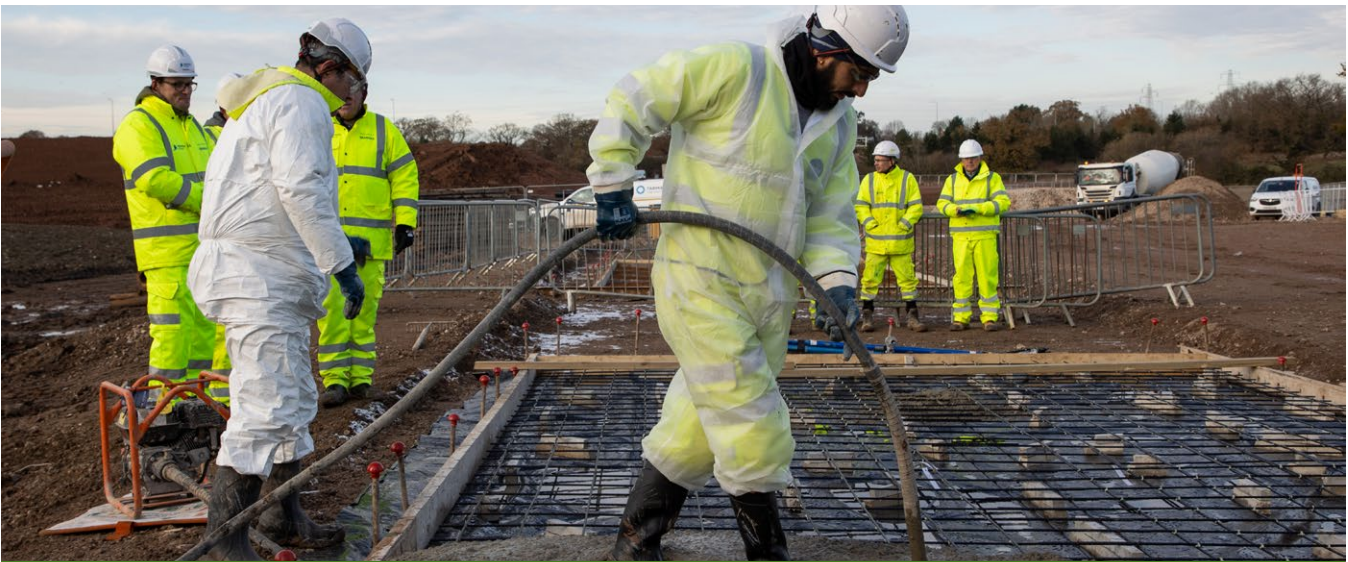
On-site trials of low-carbon concrete

National Highways to develop the research further. The next stage will be to test the low carbon combination on a permanent road, with the ultimate aim to roll out the solution across the UK's strategic road network. Read more about this trial at: www.skanska.co.uk/about-skanska/media/press-releases/269112/Paving-the-way-for-netzero-roads/