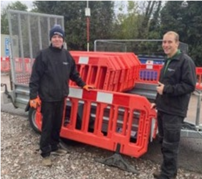
Bickenhill Parish Council receiving barriers for Remembrance Day event

Skanska and traffic management delivery partner HW Martin worked closely with the local parish council for Bickenhill & Marston Green to ensure they had 24 barriers and 7 road closure signs, allowing them to close the roads safely for their Remembrance Day parade. Bickenhill & Marston Green Parish Council said: “Thank you again for the loan of the barriers and road closure signs which enabled us to hold the parade from the church to the Garden of Memory, a very popular part of the community’s Remembrance Day celebrations. The barrier marshals loved the barriers as they are lightweight and easy to manoeuvre”