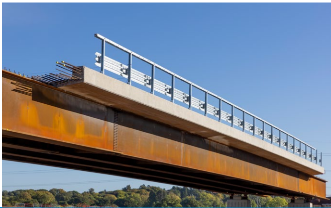
The two bridges are now safely in position over the M42