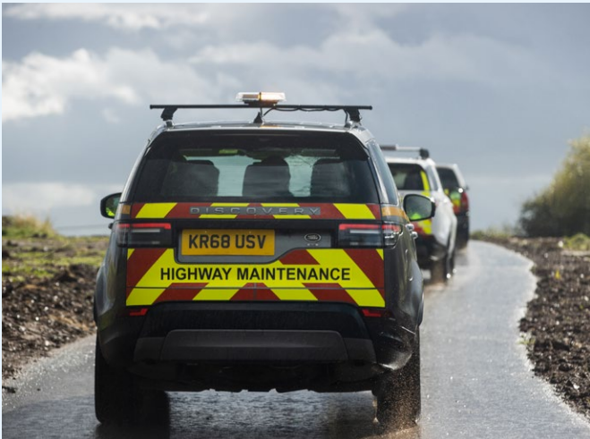
M42 ministerial visit

working hours without injury is a fantastic achievement. We’re pleased that the stringent safety measures put in place on site are paying dividends and I’m confident that it will continue to do so.”