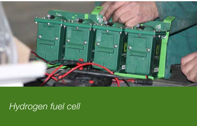
Hydrogen fuel cell

The project team have been trialling new ground-breaking technologies on the scheme that could be game changers for other National Highways road projects and the construction and highways industries as a whole.