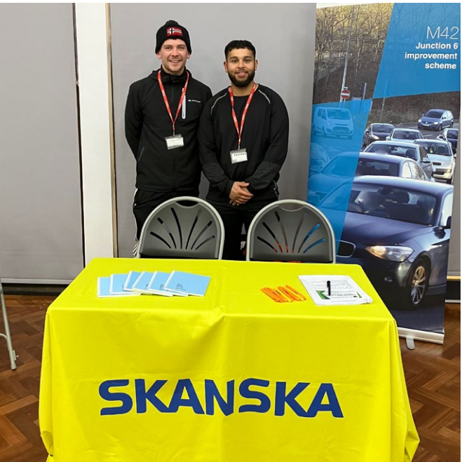
Skanska attending a STEM event within the local community

This has included a series of careers assemblies at Lyndon School in Solihull, delivering to all year groups and covering many careers, from civil engineering to environmental roles.