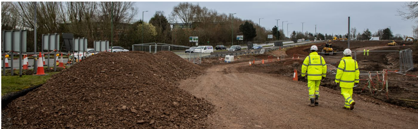
M42 junction 6 progress

In late 2022 we prepared for this work by setting up a temporary solar powered street lighting system allowing us to remove the existing lights which clash with our work. The first phase of traffic management has now been set up with several hundred metres of temporary vehicle restraint systems. This has reduced the junction to a single lane which will allow us to safely carry out the first phase of this work.