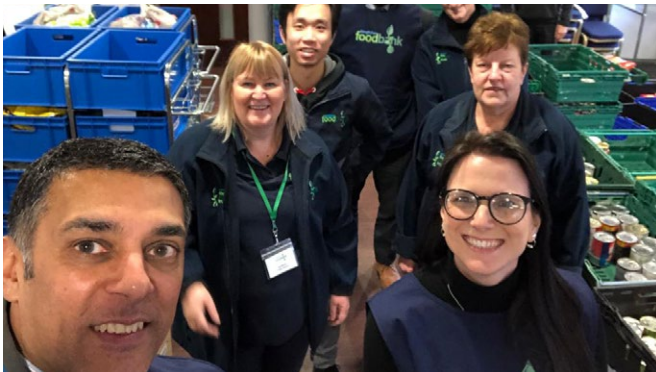
Members of the M42 junction 6 project team helping out at the food banks

Throughout November and December 2022, staff from our delivery integration partner, Skanska, collected donations for local foodbanks to help support those struggling in our local community over the festive period. Our donations were split equally between Kingfisher Foodbank and Community Essentials . Kingfisher Foodbank is run by the Trussell Trust who support a network of food banks across the UK, supported by thousands of volunteers. Community Essentials assist vulnerable individuals and families in crisis by providing them with three days of emergency food. As well as providing donations to these two brilliant organisations, staff volunteered their time at both foodbanks to help them put together their festive hampers.