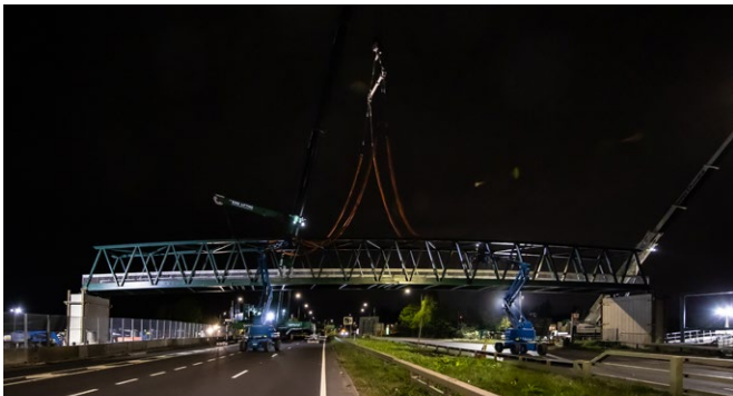
The footbridge being lifted into place