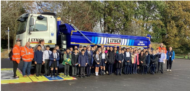
Road safety session at Coppice Junior School

L Lynch Plant Hire & Haulage , one of our supply chain partners who provide our large machinery and drivers, delivered a road safety session at Coppice Junior School as part of Road Safety Week which ran from 14-20 November 2022. They brought in a large tipper truck to show students the blind spots larger vehicles have. Prior to the visit students had taken cycling proficiency tests so this session linked in well, helping them to understand the importance of being aware of HGVs and larger vehicles while cycling on the road.