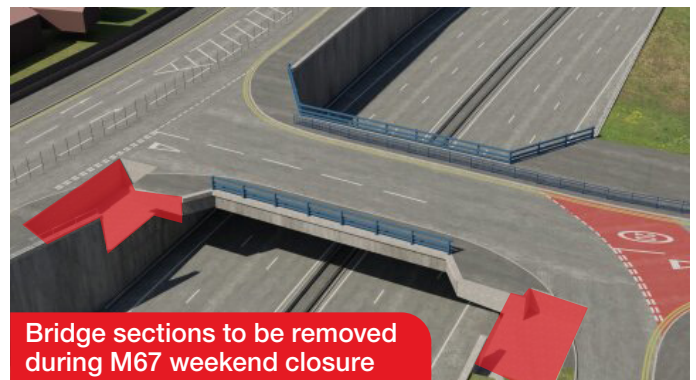
Bridge sections to be removed during M67 weekend closure

We understand the frustration that roadworks can cause. We thank you for your continued patience and understanding whilst we undertake this essential bridge replacement work.