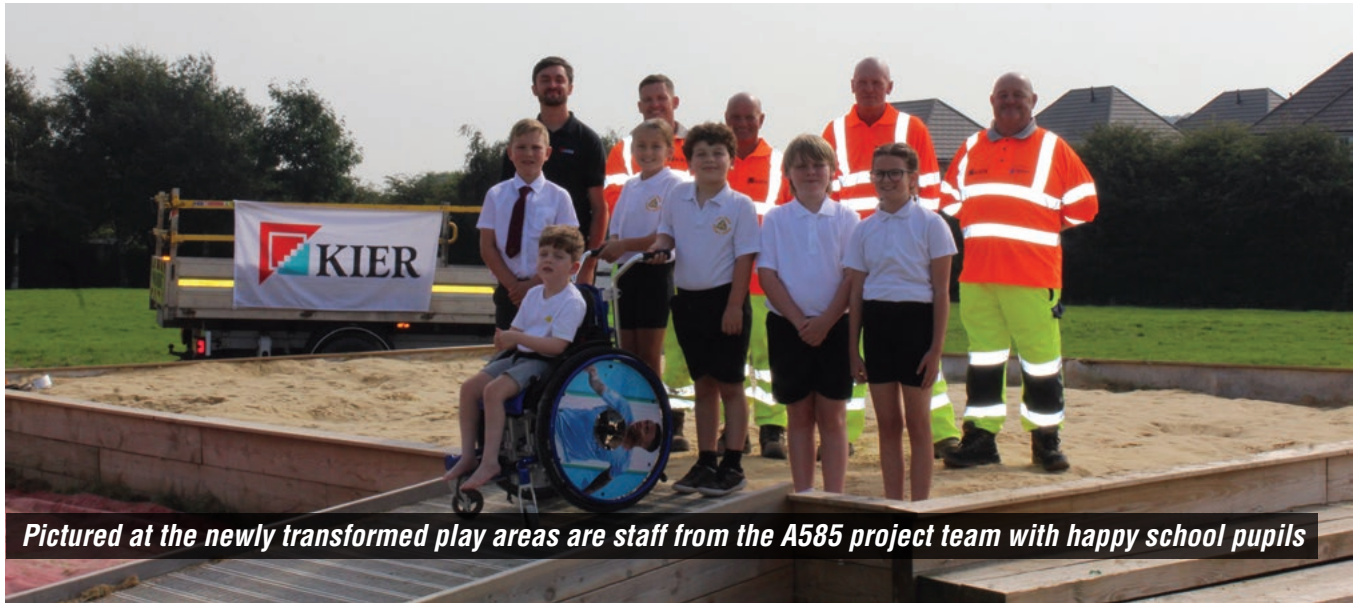
Pictured at the newly transformed play areas are staff from the A585 project team with happy school pupils