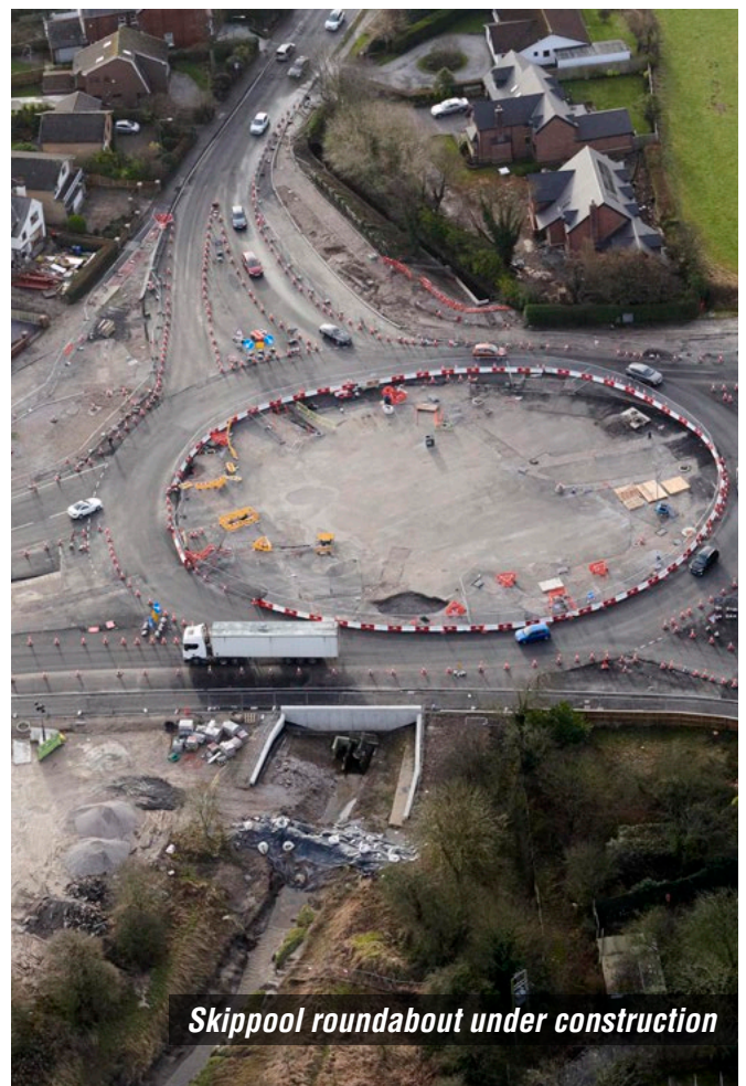
Skeppool roundabout under construction

We anticipate that there may be delays during this period and advise that you allow extra time for your journey. We would like to apologise for any disturbance this may cause you.