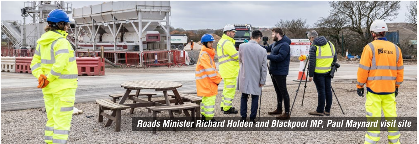
Roads Minister Richard Holden and Blackpool MP, Paul Maynard visit site

Guests were shown the latest project milestone - 4,850 tonnes of basecourse laid down in between Mains Lane and Garstang Road East.