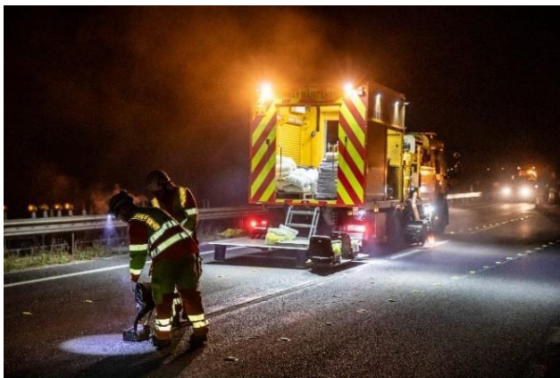
Our workers moving the safety barriers on site

Once the westbound carriageway reconstruction is complete, we'll return to the eastbound in summer 2024 to apply the finished surface layer.