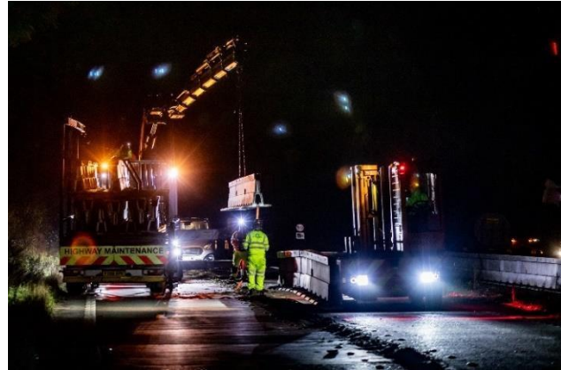
Machine used for painting lines on the road

The carriageway is still reduced to one lane in both directions as we work, and the speed limit remains at 50mph to ensure the safety of our workers and other road users.