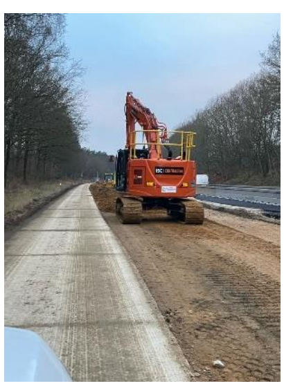
Machinery removing surplus material