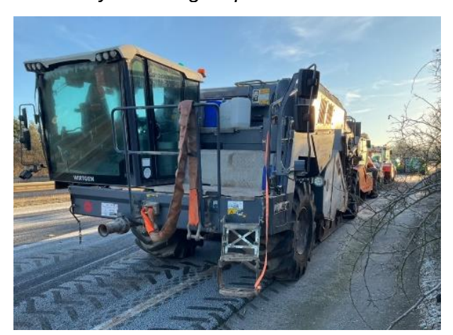
Machinery used to add the strengthening agent

A local diversion is in place for traffic wishing to access the A14 westbound entry slip road and Woolpit village from Elmswell Roundabout. HGVs needing to access Woolpit are signed via the A14 to junction 49 and back through the contraflow.