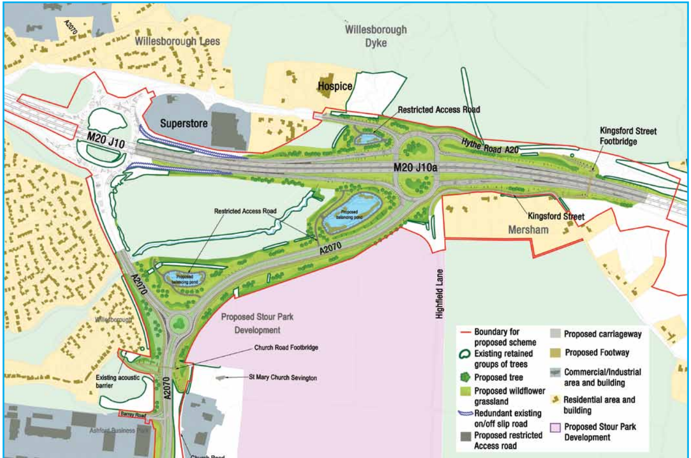
Key Plan M20 Junction 10a

Improvements to the A2070 Southern Orbital Road will provide a new dual carriageway link road with a 40mph speed limit located between the proposed new junction 10a and the A2070, a new three-armed roundabout joining the new link road to the existing A2070, the existing A2070 realigned where it joins the link road, a new Church Road footbridge/cycleway replacing the old bridge and enhancements to Barrey Road junction.