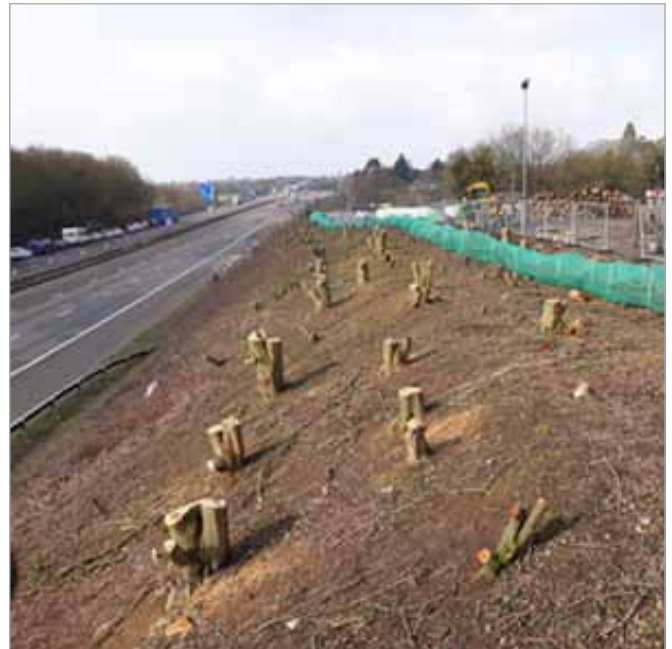
Site Clearance on embankment looking London bound on the M20

In addition, environmental personnel have worked carefully to consider the number of trees and foliage that need to be removed.