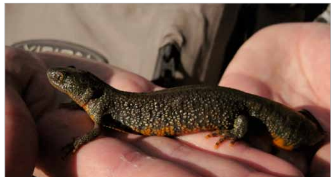
Great crested newts are present in the works region

The project region contains water voles, badgers, bats, dormouse, great crested and smooth newts as well as kingfishers. We have been working with Natural England and Ecologists to minimise disturbance to wildlife. So far we have translocated over 70 newts and 20 fish into a new permanent pond.