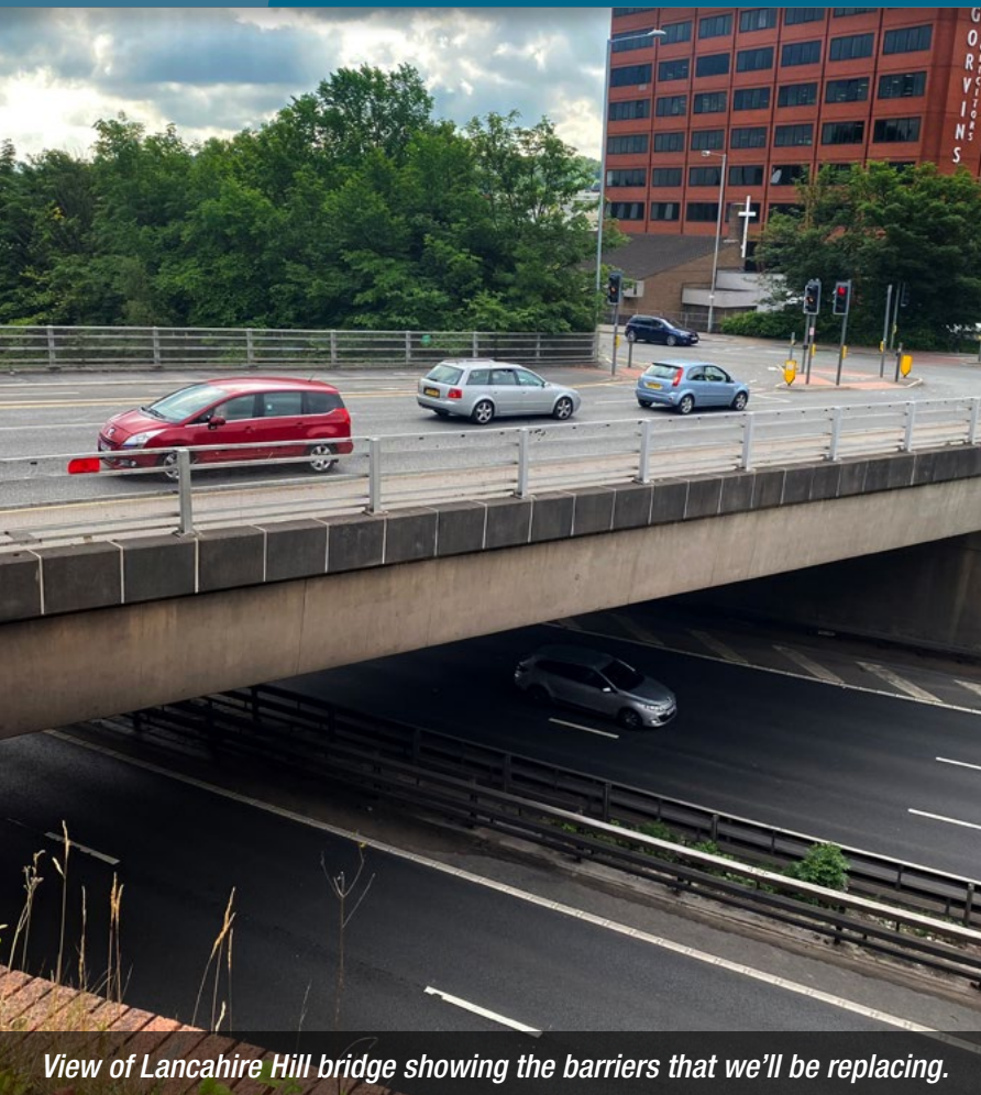
View of Lancashire Hill bridge showing the barriers that we'll be replacing.