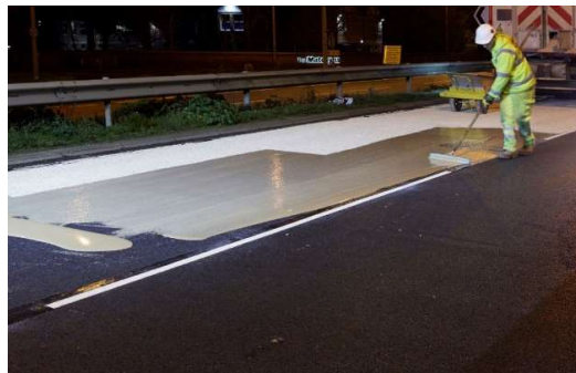
High friction road surface being laid