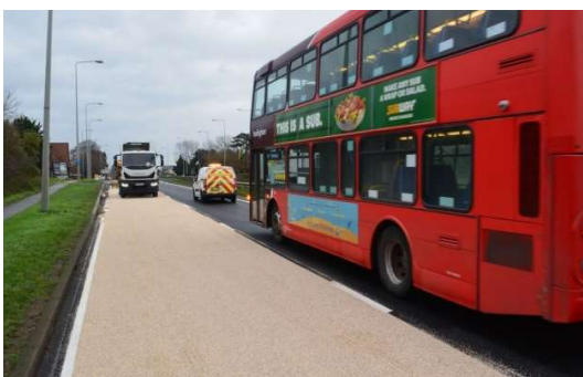
Freshly-laid high friction road surface