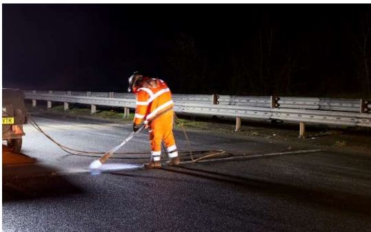
Force-drying the carriageway