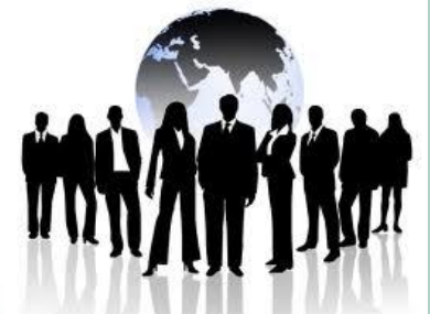
Professional, statutory and regulatory bodies (PSRBs)