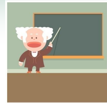
Academic Staff/external examiners/SMT