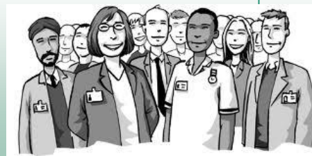
Other stakeholder groups