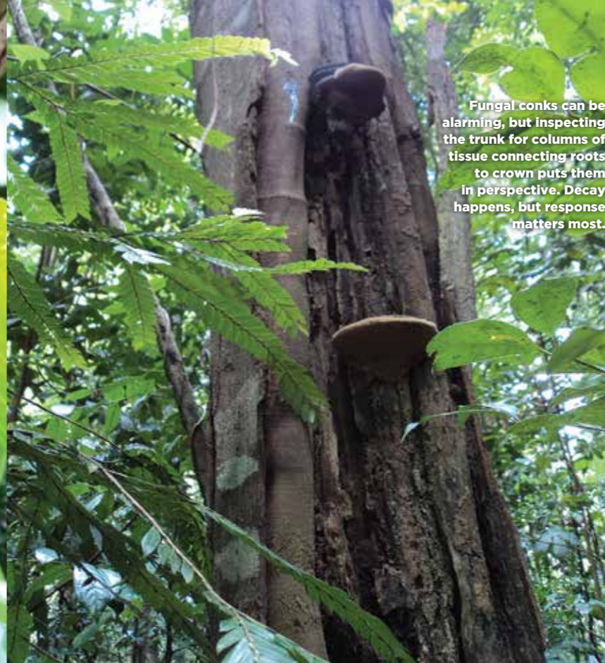
Fungal conks can be alarming, but inspecting the trunk for columns of tissue connecting roots to crown puts them in perspective. Decay happens, but response matters most.

The German and UK standards are more user-friendly because they embed informational text right in the document. The US standard does not, so it takes careful reading to suss out the meaning. For instance, “Bark tracing of wounds shall remove only dead, loose, foreign and