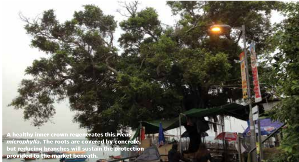
A healthy inner crown regenerates this Ficus microphylla . The roots are covered by concrete, but reducing branches will sustain the protection provided to the market beneath.

The first requirement is for arborists to consider the owner's goals in the light