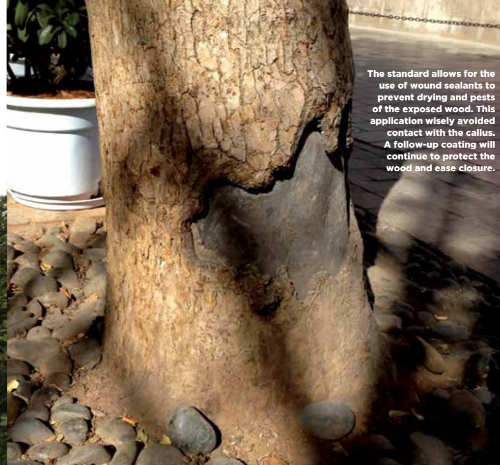
The standard allows for the use of wound sealants to prevent drying and pests of the exposed wood. This application wisely avoided contact with the callus. A follow-up coating will continue to protect the wood and ease closure.

of what tree care can and cannot do, and establish the objective. The ZTV's objective, "Provide maximum vitality health and safety of trees" is a good start but there may be other objectives to add, such as increasing wildlife habitat and shade. Once the owner and arborist agree, it's time to write specifications – "a detailed, measurable plan or proposal for meeting the objective."