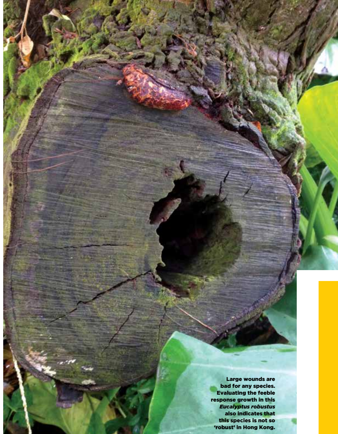
Large wounds are bad for any species. Evaluating the feeble response growth in this Eucalyptus robustus also indicates that this species is not so ‘robust’ in Hong Kong.

As the German standard notes, “Trees in urban areas often show signs of low vitality, which depends on the aboveground and belowground parts. Each tree should be examined individually. If soil aeration, moisture, and nutrients are