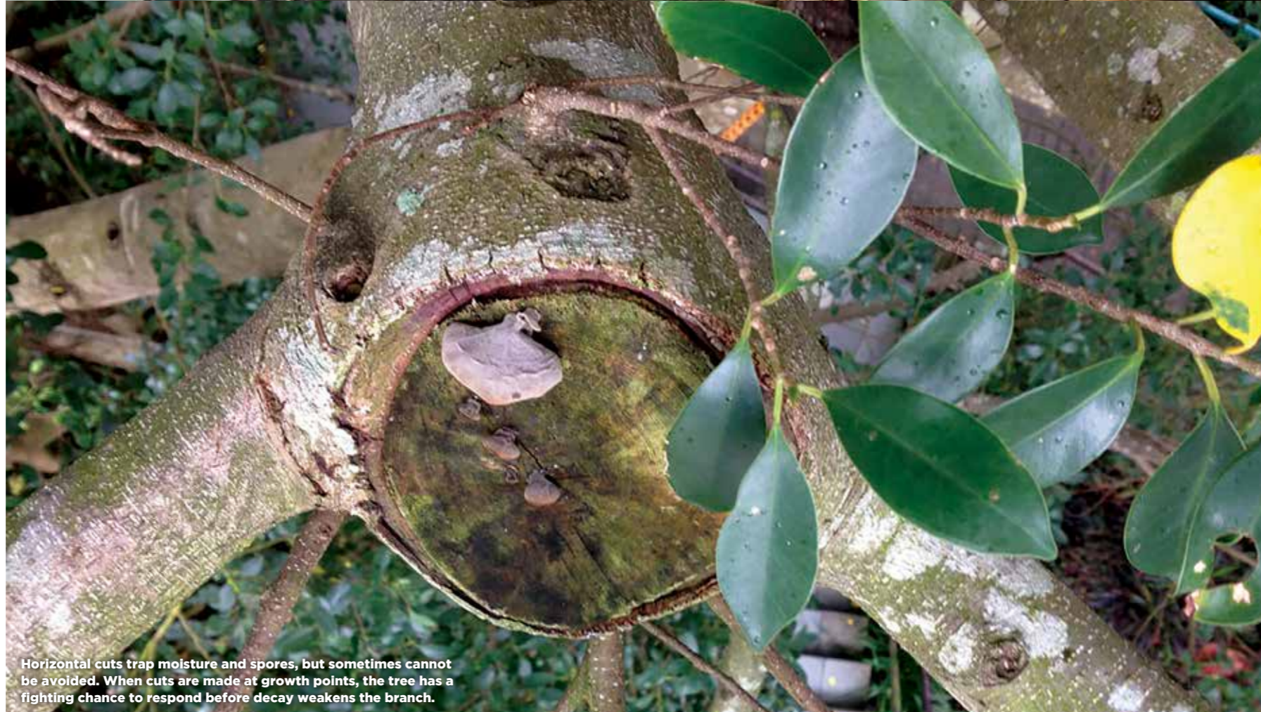
Horizontal cuts trap moisture and spores, but sometimes cannot be avoided. When cuts are made at growth points, the tree has a fighting chance to respond before decay weakens the branch.